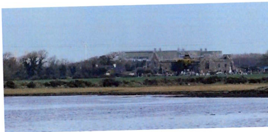
Fig. 1: 'View 7. Proposed' from Appendix A10.1: Booklet of Photomontages.